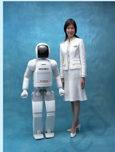
ASIMO, the world's most advanced humanoid robot, walking with a person while holding hand

Also find out about major agreements signed during high-level bilateral visits between the two nations in the recent past.