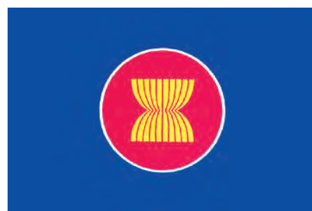
The ASEAN Flag

Locate the ASEAN members on the map. Find the location of the ASEAN Secretariat.