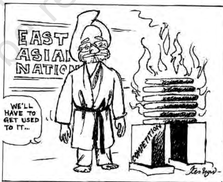
Keshav, The Hindu

India's 'Look East' Policy since the early 1990s and 'Act East' Policy since 2014 have led to greater economic interaction with the East Asian nations (ASEAN, China, Japan and South Korea).