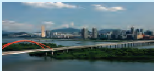
Skyline of Seoul city near the Han River

The South Korean brands such as Samsung, LG and Hyundai have become renowned in India. Numerous agreements between India and South Korea signify their growing commercial and cultural ties. Find out about major agreements signed in the recent past.