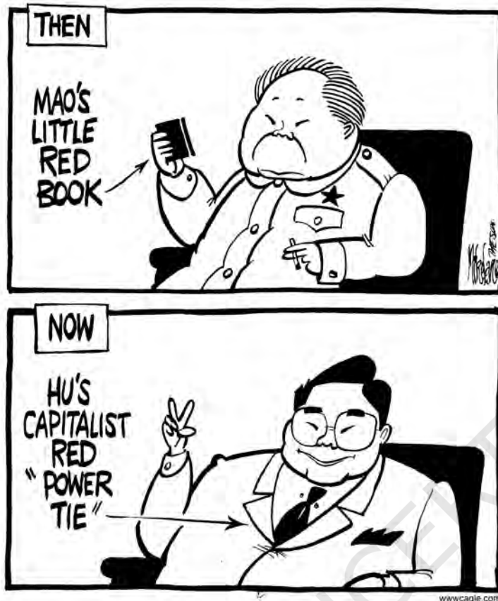
China then and now