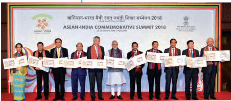
Leaders release postal stamps to commemorate silver jubilee of India and ASEAN partnership in New Delhi on 25 January 2018

Thailand. The ASEAN-India FTA came into effect in 2010. ASEAN's strength, however, lies in its policies of interaction and consultation with member states, with dialogue partners, and with other non-regional organisations. It is the only regional association in Asia that provides a political forum where Asian countries and the major powers can discuss political and security concerns.